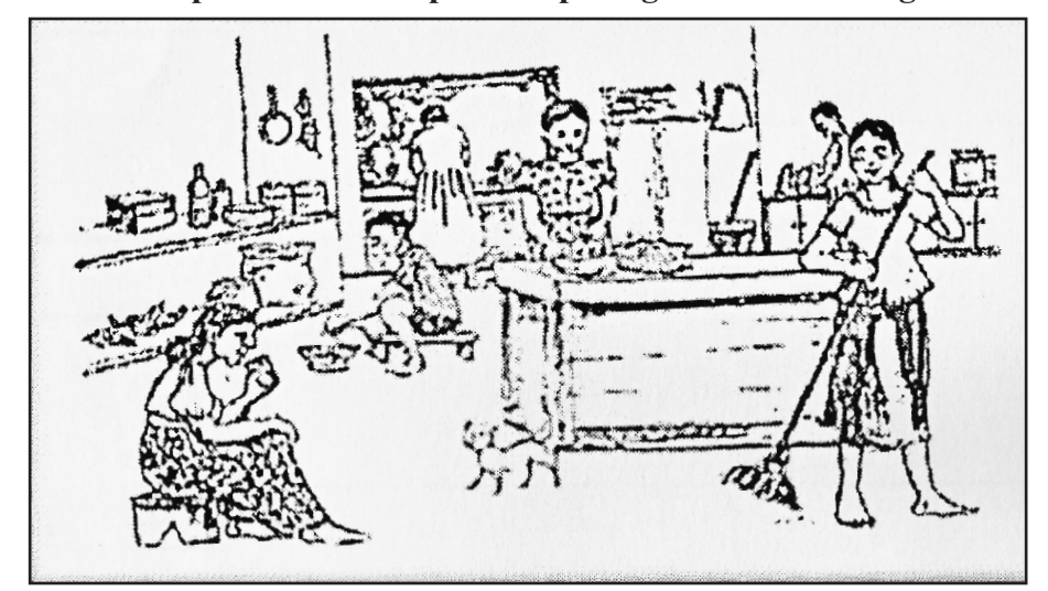
Test-06 Look at the picture and complete the passage. Use the words given in the box.

She sweeping near six busy grandmother The boy tea happy frock